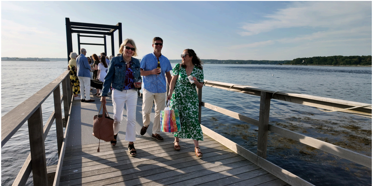
KITTERY POINT, MAINE